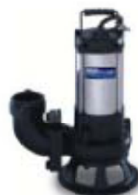
F-32T - 33