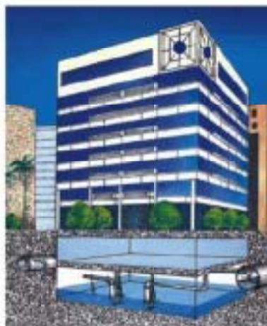
●Waste water treatment from building basement.