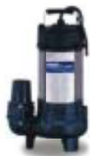
F-05U - 21U